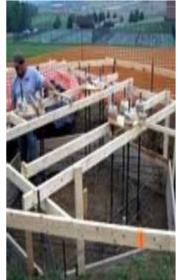
STEP I — THE FOUNDATION/ BASE FOR OUR NEW BELL TOWER