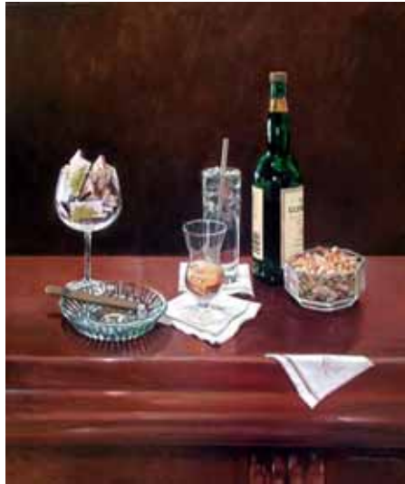
"The Tavern at Nemaocolin Woodlands"

The second exhibition was at Pittsburgh Center for the Arts, Education Department Exhibit , September 16 to November 19.